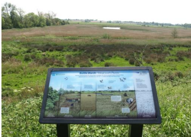
Reedbeds at Buttle Marsh created through the 2002 LIFE Bittern project

The first site visited was the How Hill National Nature Reserve which forms a large area of established wetland within the River Ant Valley with fen, reedbed, wet woodland and shallow lakes. The site is owned by The Broads Authority and management includes the commercial harvesting of sedge and reed to maintain habitat quality. Reedbeds were restored as part of the 2002 LIFE Bittern project.