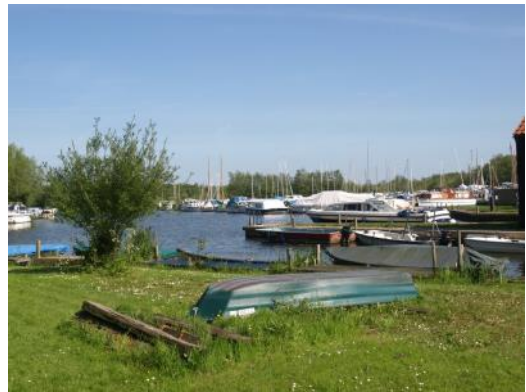
Excursion to How Hill Nature Reserve and Barton Broad (bottom right)